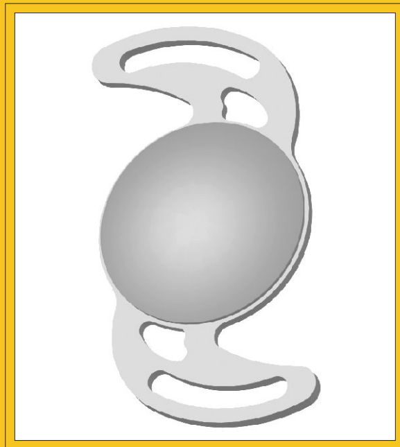
EYE DIFF Plus - R

Innovative Refractive-Diffractive Intraocular Lens