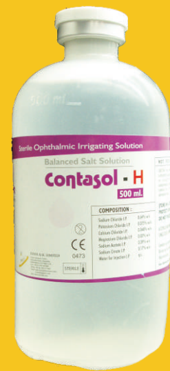
500 mL Plastic Bottle