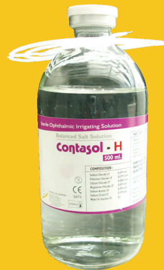
500 mL Glass Bottle