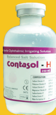
250 mL Plastic Bottle